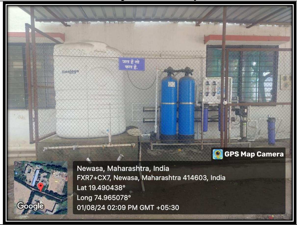
Centralized Drinking Water Facility