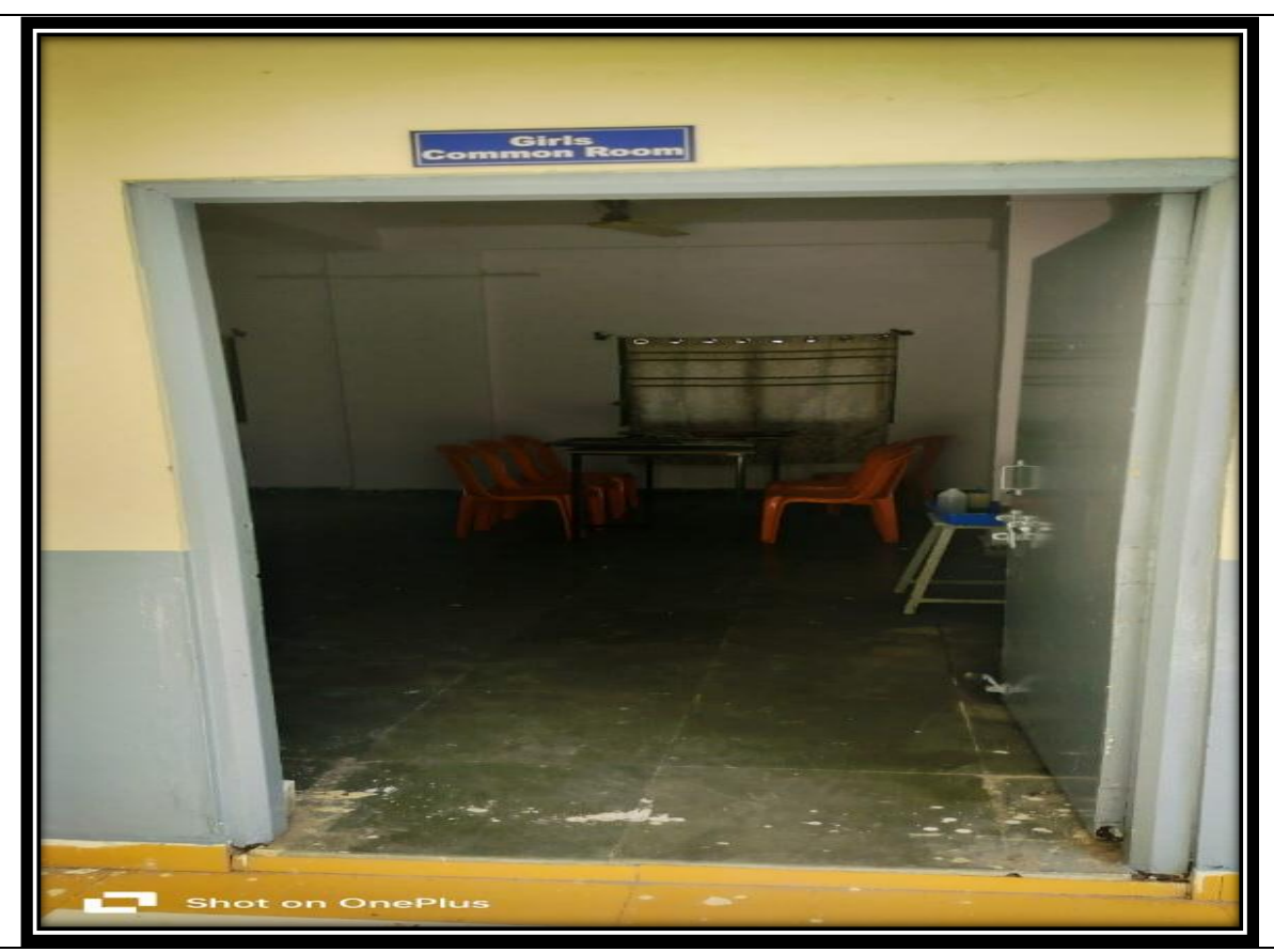
Girl Common Room